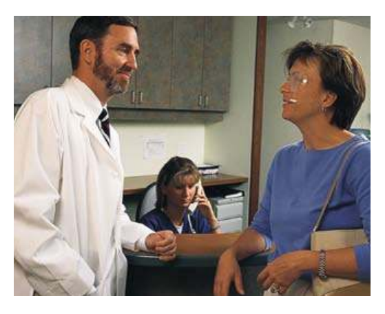
An eye shield worn after LASIK

You should arrange to have someone take you home after the surgery. Taking a nap or simply relaxing for the rest of the day is recommended. Usually your vision will be clear enough to drive to the follow-up visit the next day. The doctor may advise waiting several days before you resume a normal work schedule. The doctor should advise you on how long you should wait before resuming sports, exercise, or strenuous activity.